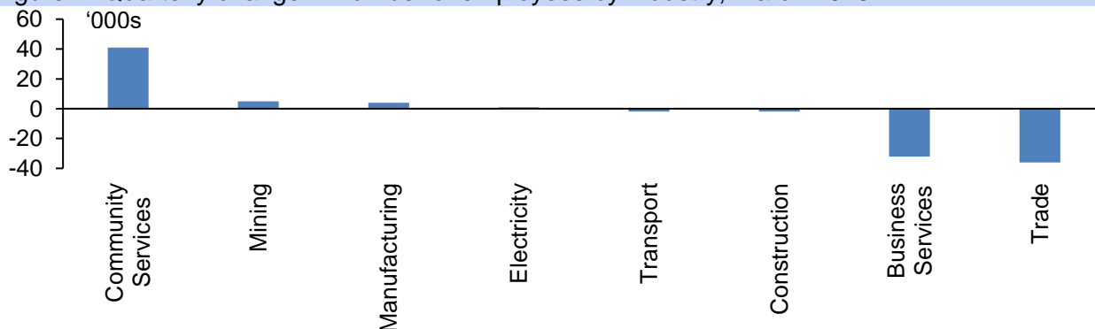
Figure 2: Quarterly change in number of employees by industry, March 2023