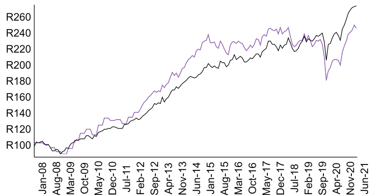
The chart represents the returns generated by a R100 investment made at inception