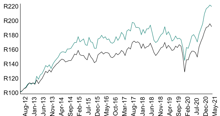
The chart represents the returns generated by a R100 investment made at inception. Investment performance is for illustrative purposes only and calculated by taking actual initial fees and ongoing fees into account for amount shown with income reinvested on reinvestment date.

— Investec Wealth & Investment BCI Equity Fund - R218 — (ASISA) South African Equity General - R190