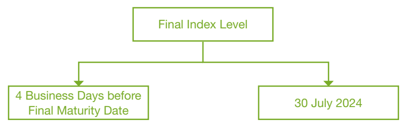
The average of the closing levels of the FTSE 100 on 30 July 2024 and the four previous Business Days

If the Plan continues to the end of year 6, the closing levels of the FTSE 100 are used to calculate the Final Index Level, as explained below: